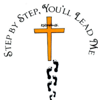
Mara Dunkin Hope Academy